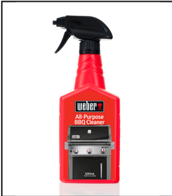
Weber All Purpose Cleaner Keep your Weber Genesis looking its best. It's unique formula will remove grease, fat and smoke stains, to keep your barbecue clean.