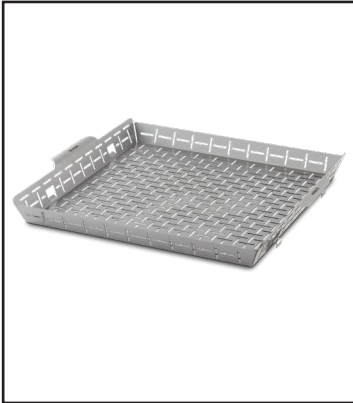
WEBER CRAFTED Grilling basket Perfect for cooking smaller, more delicate items that might otherwise fall through the grills, this Grilling Basket fits perfectly into your WEBER CRAFTED frame kit. Dishwasher safe, stainless steel construction.