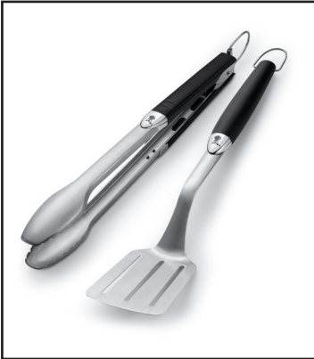
Precision grill tongs & spatula set Durable stainless-steel construction and soft-touch handle for comfort and control.