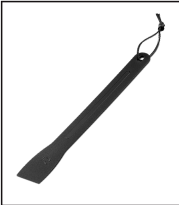
Cookbox scraper Keep your barbecue cookbox free of grease build-up and food scraps.