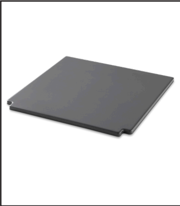
WEBER CRAFTED Pizza stone This glazed pizza stone fits perfectly into the WEBER CRAFTED frame kit, allowing you to make perfectly crispy pizzas and artisan bread in your Genesis.