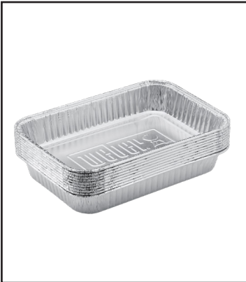
Drip pans These drip pans line the drip tray of your Genesis to make the disposal of grease more simple. With a quality aluminium construction, these trays are easily replaced when a layer of fat and grease accumulates.