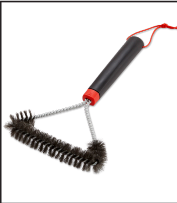
Grill brush - 30 cm This three-sided grill brush is made to remove grease and debris from cooking grills of all sizes. The handle design provides a secure grip when brushing off stuck-on food or cleaning tight spaces.